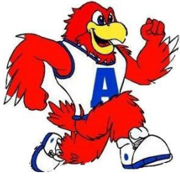
Ashland Elementary Falcons